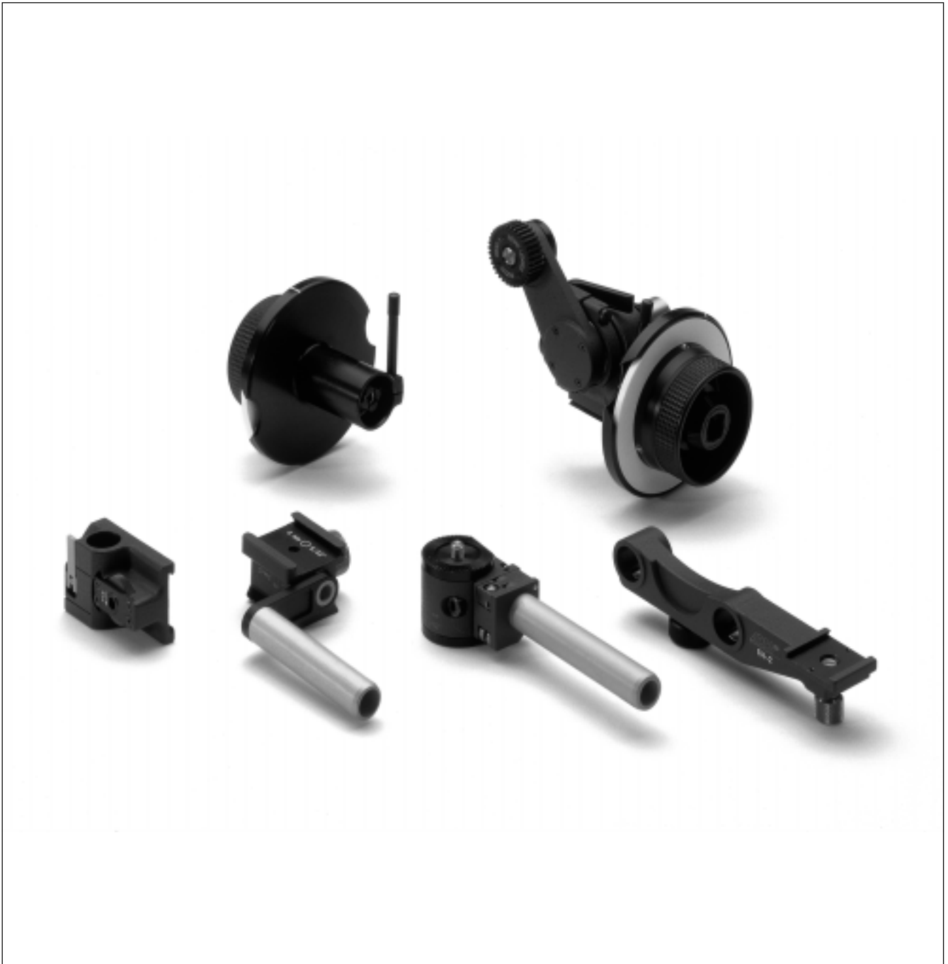
Lightweight Focus Drive LFD System