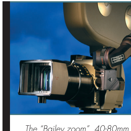
The "Bailey zoom", 40-80mm