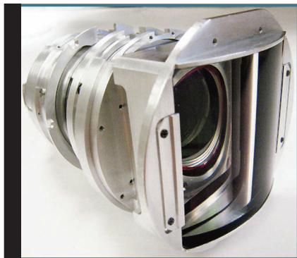
A G-Series 35mm anamorphic lens during the manufacturing process

All of the new anamorphic lenses are engineered to produce superior image quality, and feature high contrast and resolution, minimal aberrations, and excellent field illumination, as well as low veiling glare, ghosting, and distortion. The lenses utilize Panavision's patented anti-mumping technology, but unlike previous series, there is no hump for the gear-set, so the lenses maintain their cylindrical profile.