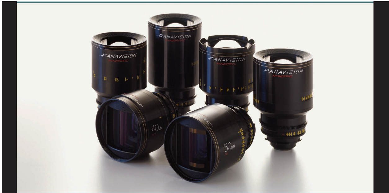
The new G-Series Anamorphic Prime Lenses